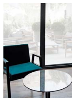
Alma Hotel (Barcelona, Spain)