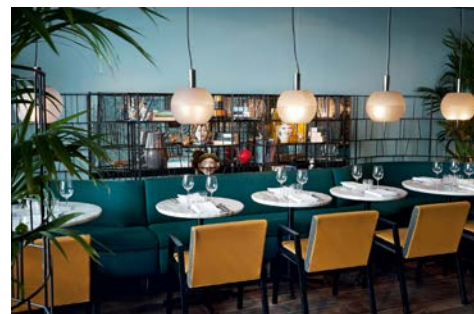
Le Café Restaurant (Paris, France)