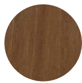
T43 Dark Walnut