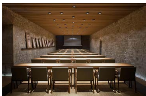
Marqués de Murrieta (Logroño, Spain)