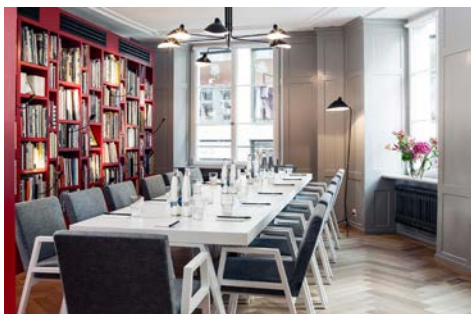
Marktgasse Hotel (Zurich, Switzerland)