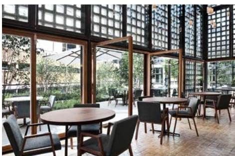
Bosco de Lobos (Madrid, Spain)