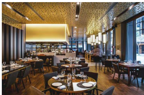
La Luz Restaurant (Dubai, United Arab Emirates)