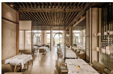
Sahrai Hotel (Fez, Morocco)