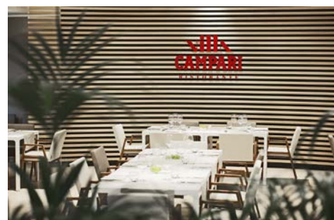
Villa Campari Restaurant (Milan, Italy)