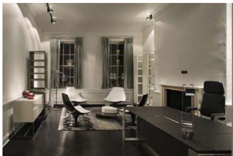
A Gentlemen's Club (London, Great Britain)