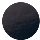
T20 RAL 9005 Gloss Black