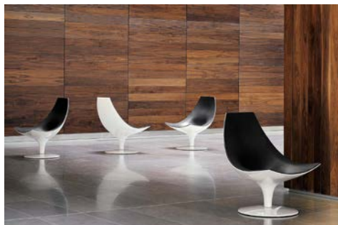
Wells&More (London, Great Britain)