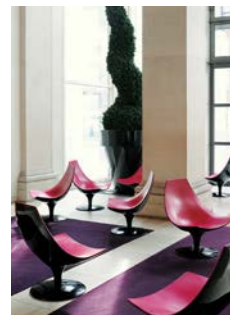
Media.Com (London, Great Britain)