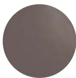
T95 RAL 7006 Mud